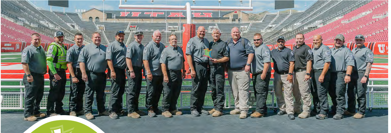
Achievement in Safety by an Organization: Utah Department of Transportation- IMT Division